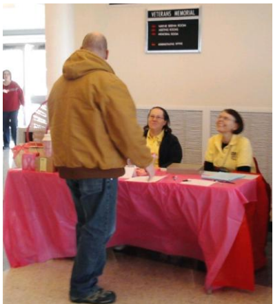
NCOEA Members at our raffle table. The half the funds going to the Susan G Koman fund for breast cancer , the rest going to the NCOEA scholarship fund.

The Fall Rep. Assembly was held at Veterans Memorial in Columbus Ohio on December 3 rd , 2011. We had many delegates in attendance from various NCOEA schools.